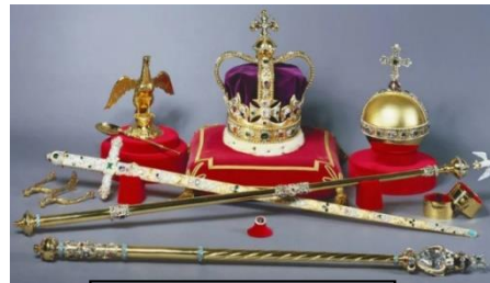
The Crown Jewels