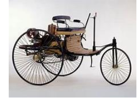
The first Benz car compared to a modern-day Mercedes Benz