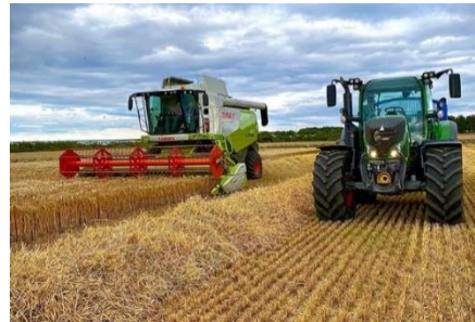
Some crops are harvested using a combine harvester.