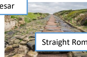
Straight Roman roads