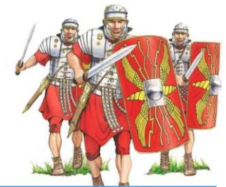
The Roman army was well organised